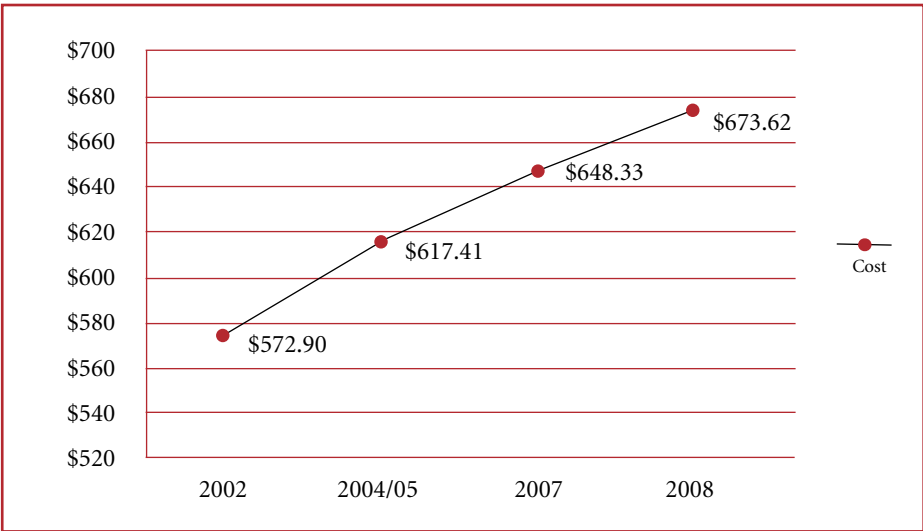
Figure 1: The monthly cost of the National Nutritious Food Basket for the reference household of four in Nova Scotia: 2002-2008

The cost of a basic nutritious food basket has steadily increased since participatory food costing was first conducted in Nova Scotia in 2002. The graph below shows the rise in the cost of this basket for a reference household of four. Food costing in Nova Scotia indicates that, since 2002, there has been an almost 18% increase in the cost of the food basket for this reference household. In 2008 the monthly cost of the basic nutritious food basket was $673.62. The cost of the food basket is $1208.64 greater per year, or $100.72 greater per month in 2008 than it was in 2002. This increase is consistent with the Consumer Price Index inflation rates for food in Nova Scotia since 2002. 23