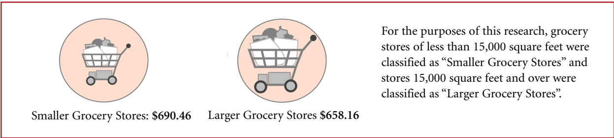
Figure 4: Average monthly cost of purchasing the National Nutritious Food Basket for the reference household of four in smaller and larger grocery stores in Nova Scotia (June 2008)

A basic nutritious diet purchased at smaller grocery stores costs on average $32.30 more per month than the same basket purchased at larger grocery stores in Nova Scotia (Figure 4). This statistically significant difference is also consistent with findings from 2002, 2004/05, and 2007.